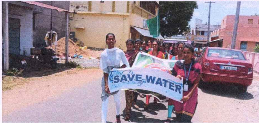
Pledge taking ceremony to Protect the Nature by the students